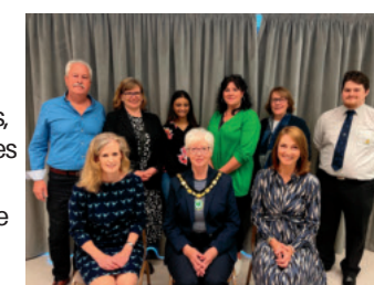
Community Grant recipients