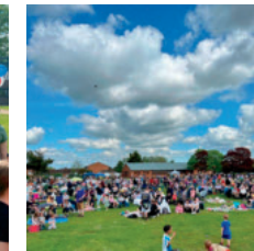
Over 2000 visitors