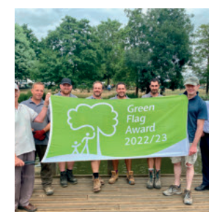
Green Flag Award