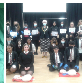
Presenting awards at Bulmershe School