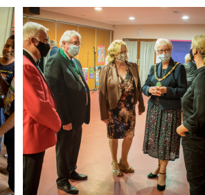
Attending Woodley Concert Band's performance