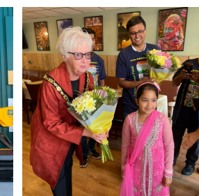
Opening of Adda Hut restaurant