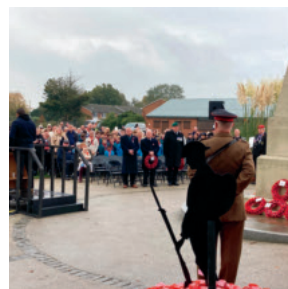
Woodley Memorial Remembrance Sunday event