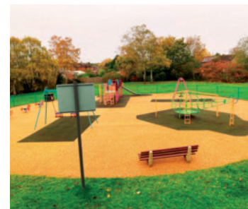
Malone Park after renovations