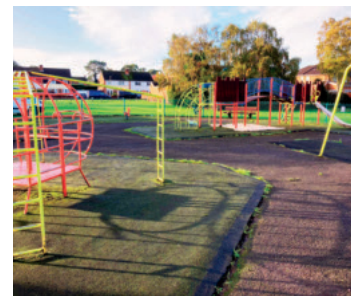
Malone Park before renovations

Full details of all of these projects can be found in the Strategy & Resources Agenda Pack, dated 12th September 2023, which is available on our website.